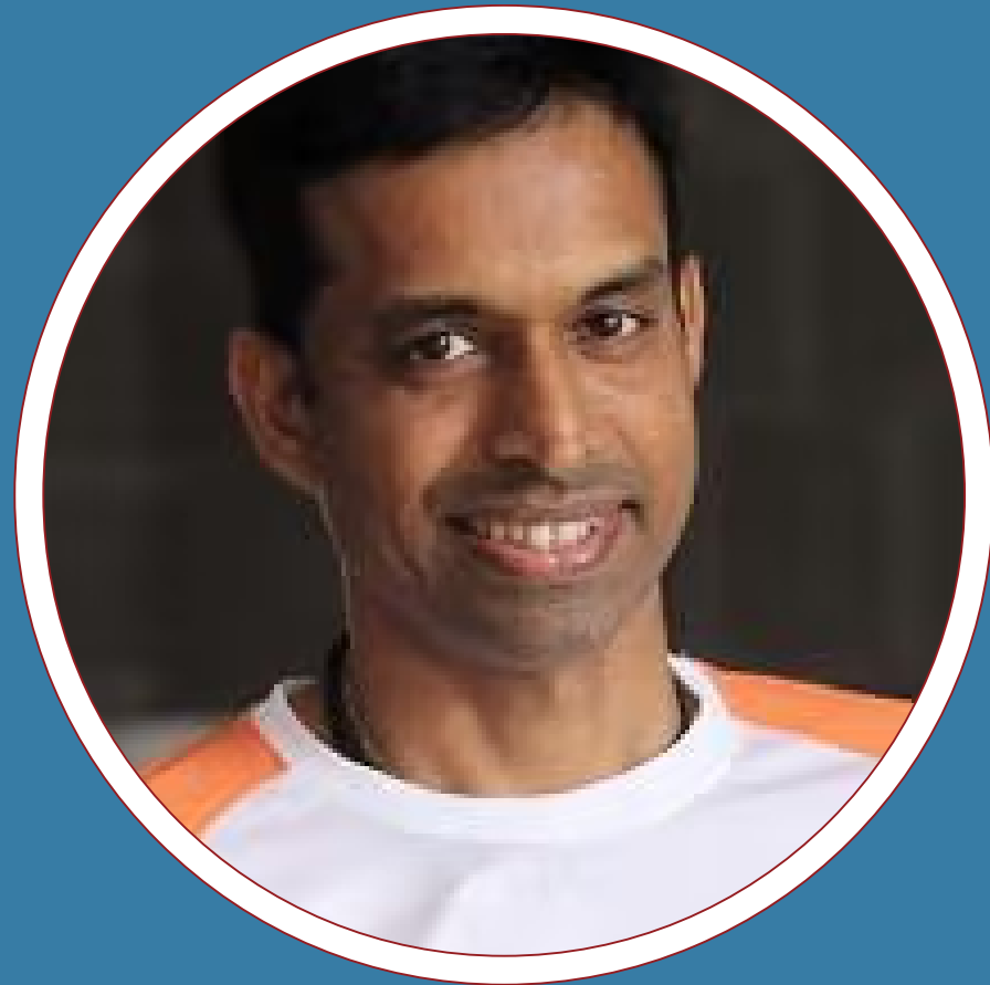
Pullela Gopichand All England Open Badminton Champion, 2001. Padma Bhushan