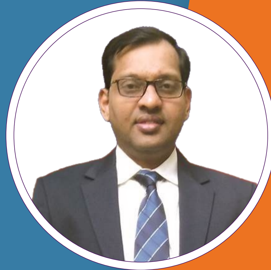
Arunachalam R, President of Institute of Actuaries of India